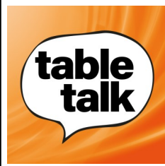
TABLE TALK FOR CHRISTMAS - All Welcome

11.30am - 12.30pm at St Chad's Wednesdays 4th, 11th and 18th Dec