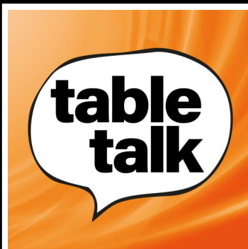
TABLE TALK FOR CHRISTMAS